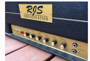
68/50 FL #34 50 watt Master Model Head.