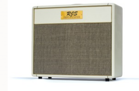
Lead/Bass 20 watt 1x12 Plexi Combo

The RJS Lead/Bass 20 is based on the original 18 and 20 watt British amps. Two EL84's and two 12AX7's. Two channels Lead and Bass with separate volume and tone for each channel. Channels can be jumped like the original Plexi amps. One 12" Celestion G12H 25 watt Greenback or optional 65 watt Creamback is offered.