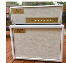
Offset 68/50 with 2x12 cabinet

Shown here as a offset with 2x12 cab or head as a non master volume or as shown with Master volume. The 50 watt and 100 watt amps I build have many options to choose from to suit the players needs. Everything from stock plexi type or higher gain with master volume Frank Levi mods or EVH spec mods. The choice is yours.