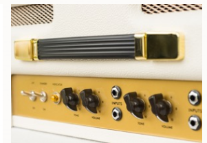
Controls of the Lead/Bass 20 watt.